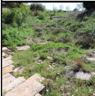
Stop #5: Look below on both sides of the bridge to study the bioswale. The one from the seep runs under this bridge to the wet prairie. (Stay on the bridge—it's Stop #6)

Guidance: Since sycamores are fast growing trees, their bark can't expand as quickly as needed and it breaks and peels off. Similar to how a snake sheds it's skin.