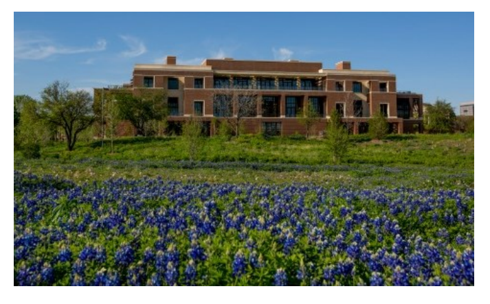
The Bush Center from the south, overlooking the Native Texas Park.

A one mile network of paths will take you through native Texas environments such as Blackland Prairie, Post Oak Savannah and Cross Timbers Forest.