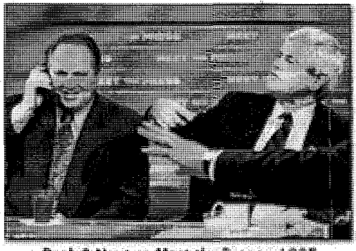
Rush & Newt on Meet the Press - 1995

All right now, Newt. Let's retrace this just to put it all in context. First thing Newt does, well, not the first thing, but in recent months, Newt, very critical of the Bush state department, particularly as it relates to Israel and dealing with the United Nations as well, but primarily Israel. And then later came out in favor of this omnibus Medicare entitlement, and in an interview last Wednesday in the National Tennessean, well, it was published yesterday, but in a conference call last Wednesday, he said, "Rush Limbaugh has done as much as any person to put us on the wrong side of this issue. He got bad